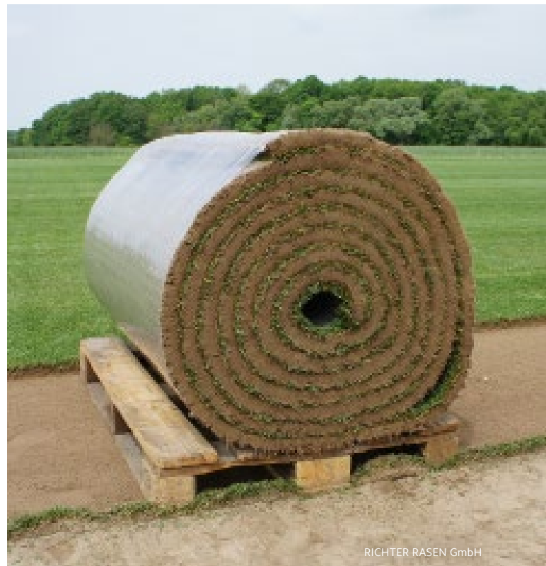
RICHTER RASEN GmbH

In Sports Turf Basfoliar® Root Booster SL is especially recommended for the rapid establishment of a stable and resilient turf sward.