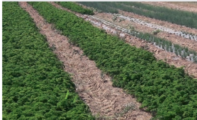
On the left: Basfoliar® Root Booster SL in parsley, on the right: control